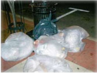
East Front St.