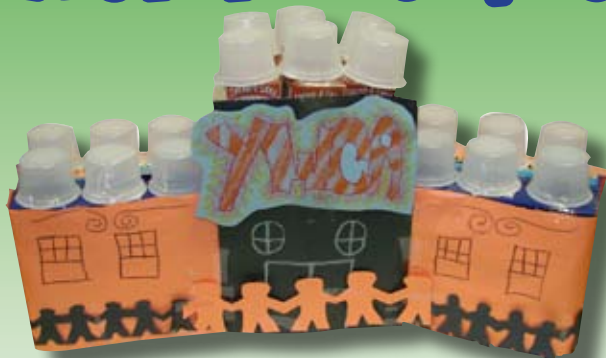
"CREATING ART FROM RECYCLED MATERIALS"