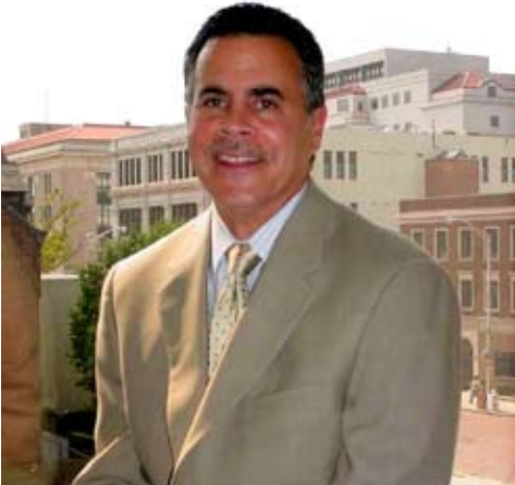
John S. Waston Jr. holds the position of Deputy Commissioner for Natural Resources in the New Jersey Department of Environmental Protection (NJDEP)

On behalf of the NJDEP I applaud the work that the PMUA does and I would like to discuss why individual environmentalism is so important in the context of addressing the significant environmental issues that we face today.