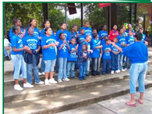
Ruth Fellowship Youth Choir performed uplifting songs for the day's audience